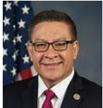
Congressman Salud Carbajal California 24 th District