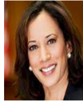
Kamala Harris California Senator