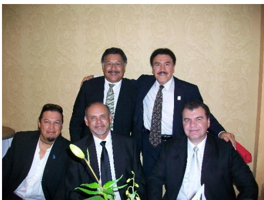
Supporters and Artists