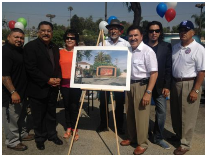
Friends of Mexico's Escuadron 201 Monument