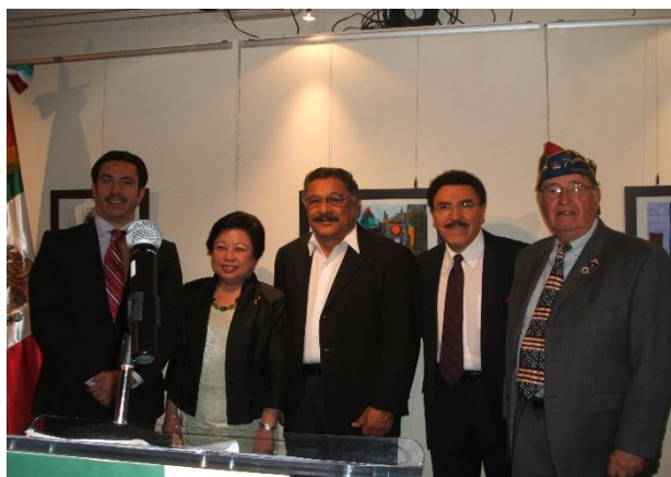
Reception at the Los Angeles Mexican Consulate April 19, 2012