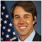
Congressman Beto O'Rourke Texas 16 th District