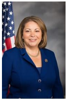
Congresswoman Linda Sanchez California 38 th District