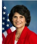
Congresswoman Lucille Roybal-Allard California 40 th District