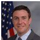
Congressman Duncan Hunter California 50 th District