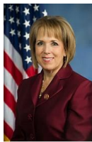
Congresswoman Michelle Lujan Grisham New Mexico 1 st District