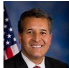
Congressman Juan Vargas California 51 st District