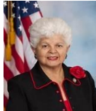
Congresswoman Grace Napolitano California 32 nd District