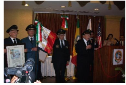
Reception for Escuadron 201 Los Angeles, Ca.