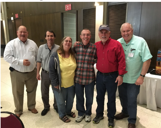
A happy group of Hood's Brigade Association members attending the Baton Rouge Civil War Round Table Seminar in April, 2018. Members enjoy studying all aspects of the Civil War & end up making lifelong friends through the Association.