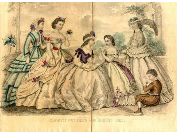
Godey's Fashion Plate, illustrating the gown which inspired Adele Lubbock's inaugural gown (second from left).

144 pages, with both four-color and black and white historic photos, $50.00 plus tax of $4.13 (shipping additional). Copies are available for sale to the public.